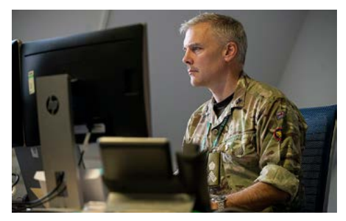
Image 4, British Army Brigadier Chris King, Chief of the EUCOM Control Center – Ukraine / International Donor Coordination Centre oversees aid supply operations on Patch Barracks, Germany, June 3, 2022.

pipelines, electricity and data cables. However, there is only limited mention of this vital infrastructure in the Report of the Commission on Defence (2022) or indeed the now badly out of date Defence White paper 2015.