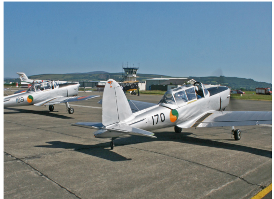
Air Corps Museum and Heritage Project, Casement Aerodrome, Baldonnel