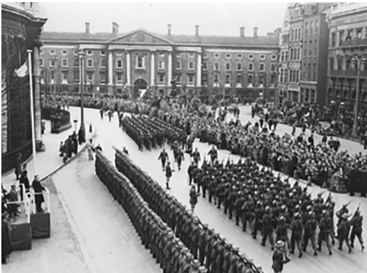
Parade at College Green for Republic of Ireland celebrations, 1949

I rith bhliain an chéid, 2016, beidh taispeántais, cainteanna, seimineáir agus ócáidí eile trína ndéantar scrúdú ar Éirí Amach 1916 agus an tábhacht a bhí leis don eagraíocht agus don tír. Beidh na hionaid oidhreacht – an Chartlann Mhíleata agus iarsmalanna éagsúla Óglaigh na hÉireann – chun tosaigh maidir leis na tionscnaimh seo, ach beidh béim á chur freisin ag na bialanna agus ag laethanta oscailte ar 1916.