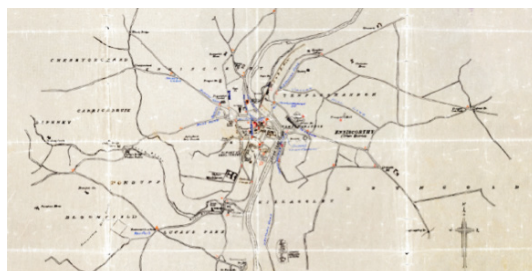
Map of Enniscorthy during Easter 1916 from the MSPC

In 2016, Military Archives will continue to make available material from the BMH. Already, Military Archives has digitised some 36,000 pages of witness statements, many including original testimony from participants in 1916. These statements are available to all online and are fully word searchable. Further digitisation of the BMH contemporary documents series will continue to enrich our understanding of this period.