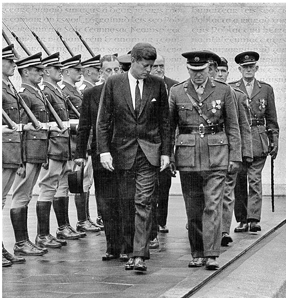
U.S. President John Fitzgerald Kennedy reviews Officer Cadets at the Arboaur Hill 1916 memorial, June 1963 Tugann Uachtarán na Stát Aontaithe John Fitzgerald Kennedy léirbhreithniú ar Dhaltai Oifigigh ag leacht cuimhneacháin 1916 i gCnoc an Arbhair, Meitheamh 1963.