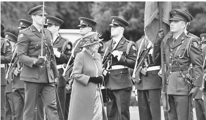
Queen Elizabeth II of the United Kingdom reviews a Guard of Honour at Áras an Uachtarán, May 2012

Beidh ról mórtábhachtach ag Óglaigh na Éireann maidir le Searmanais Stáit ar fud na tíre i rith na bliana 2016 ar an leibhéal náisiúnta agus ar leibhéal na n-údarás áitiúil. Cé go mbeidh na searmanais is mó ar bun sa phríomhchathair agus ar láithreacha eile inar tharla eachtraí i rith an Éirí Amach, mar shampla in Inis Córthaidh agus i gCill Dhéagláin, beidh daoine de chuid Óglaigh na hÉireann ag cuidiú le searmanais i ngach contae sa Phoblacht, ar fud na 31 údarás áitiúil ar fad, ag a mbeidh an Bhratach á hArdú. Tá Searmanas Míleata ina ghné d'ócáidí Stáit ó baineadh an tSaoirse amach sa bhliain 1922, rud a chinntíonn go mbíonn an mhaorgacht agus an tsollúntacht chuí ag baint le gach Comóradh Náisiúnta, Insealbhú Uachtaráin agus Cuairt Stáit.