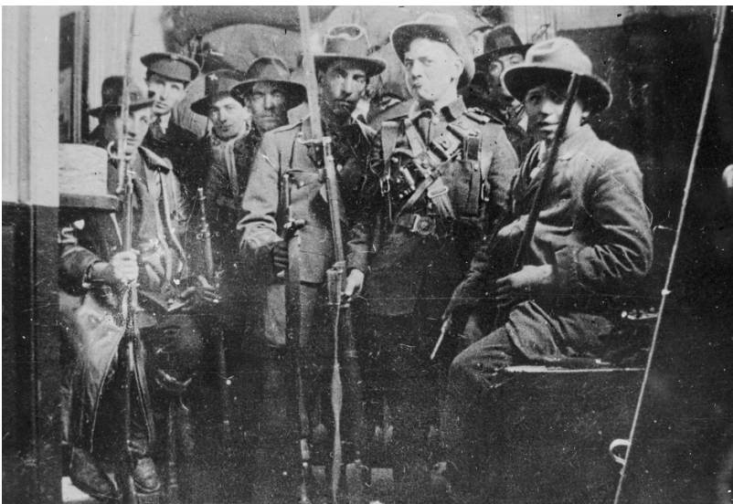
Rare photograph taken inside the GPO during Easter week 1916, showing Irish Volunteers and a member of the Irish Citizen Army. This photograph forms part of the Bureau of Military History Collection in Military Archives.

Is é Bailiúchán na bPinsean Seirbhíse Míleata (MSPC) an mhór-réimse deireanach de thaifid Stáit a bhí as amharc go dtí seo a bhaineann le hÉirí Amach 1916. Ón mbliain 2008 i leith, tá meitheal gairmiúil cartlannaíochta ag obair sa Chartlann Mhíleata d'fhonn ábhar as an mbailiúchán a bhaineann le Éirí Amach 1916 a fhoilsiú, na comhaid iomlána san áireamh a bhaineann le beagnach 2,600 duine a raibh baint go díreach acu le heachtraí na bliana 1916 agus a fuair pinsean ón Stát mar gheall ar a gcuid seirbhíse. I rith na bliana 2016, beidh ábhar eile nach bhfacthas go dtí seo á fhoilsiú ag an gChartlann Mhíleata, na comhaid maidir le boinn a bhaineann leis an mbliain 1916 san áireamh chomh maith le hábhar flúirseach eile, mar shampla tuairiscí ar bheartaíocht bhriogáidí agus deis aimsithe maidir le rollaí ainmneacha na n-eagraíochtaí réabhlóidíochta.